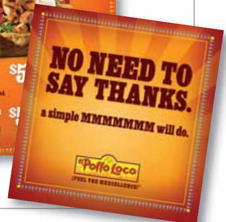
EL POLLO LOCO AD CAMPAIGN