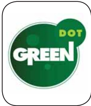
GREEN DOT Logo - Design