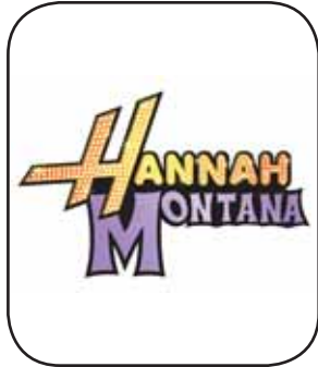
HANNAH MONTANA -DISNEY CHANNEL Logo - Design

SAMPLES 818.634.9287 EMAIL: RICCO@KUEST44.COM