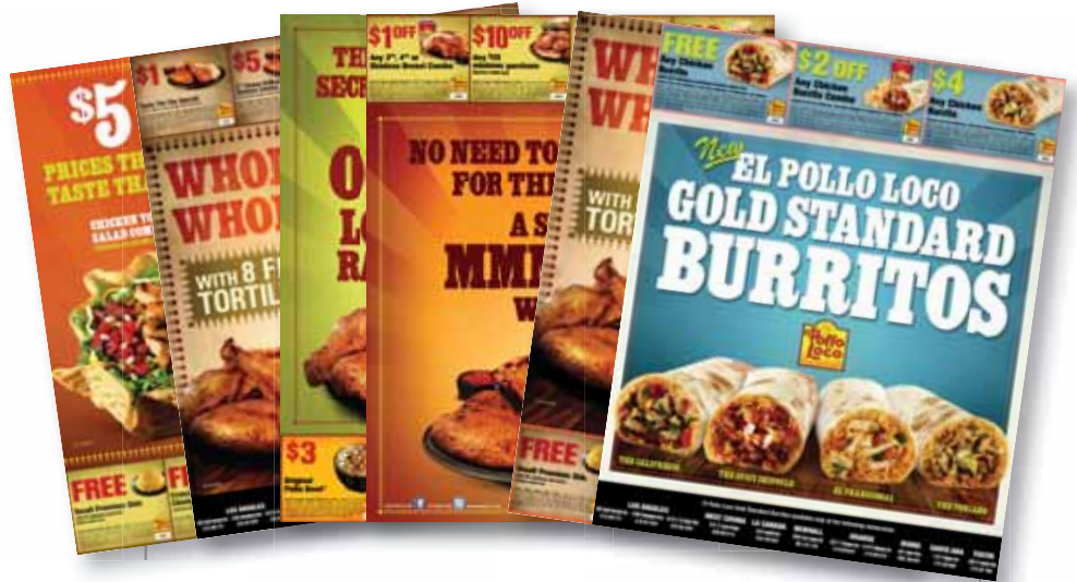
EL POLLO LOCO AD CAMPAIGN