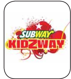
SUBWAY - KIDZWAY Logo - Design