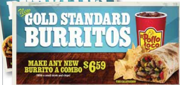
EL POLLO LOCO AD CAMPAIGN