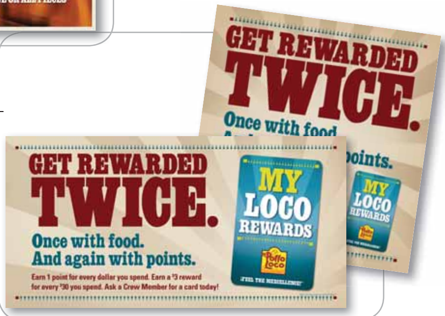
EL POLLO LOCO AD CAMPAIGN