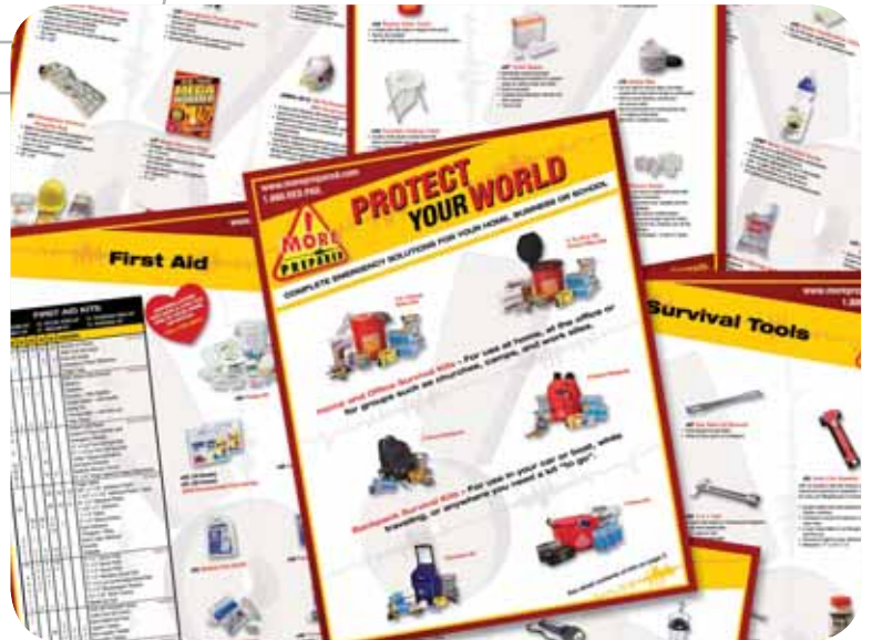
MORE PREPARED BROCHURE