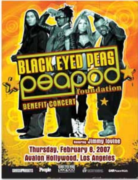
PEAPOD Foundation MAGAZINE AD