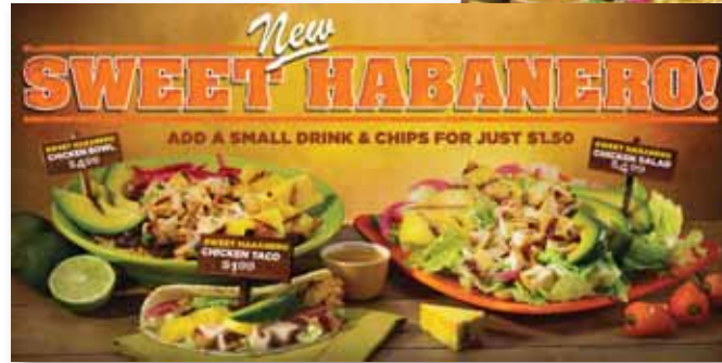
EL POLLO LOCO AD CAMPAIGN