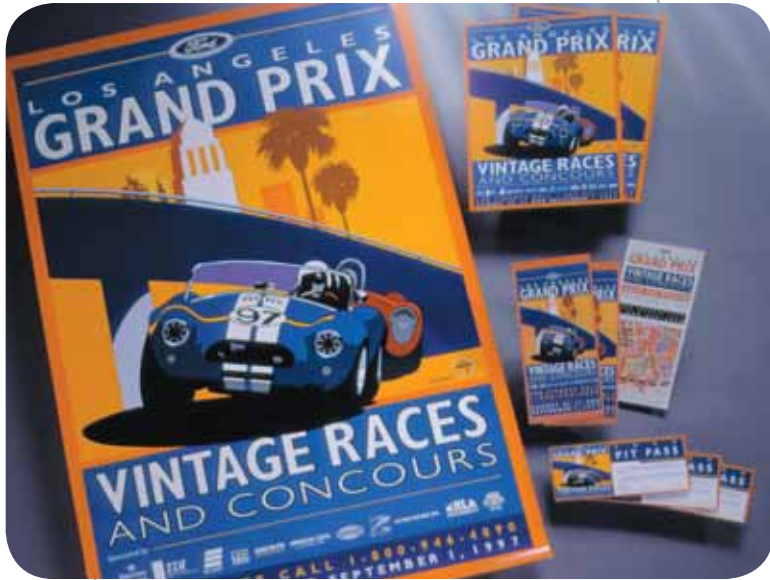
FORD OUTDOOR ADVERTISING