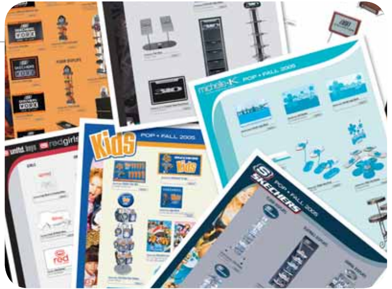
SKETCHES SELL SHEETS

SAMPLES 818.634.9287 EMAIL: RICCO@KUEST44.COM