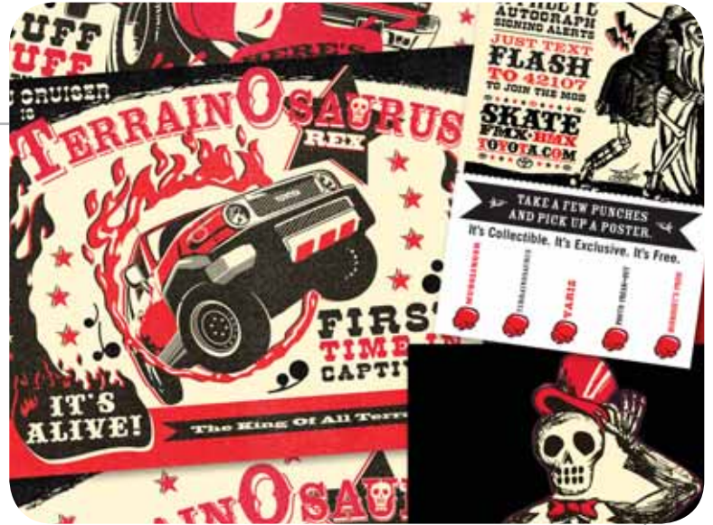
TOYOTA OUTDOOR CAMPAIGN

SAMPLES 818.634.9287 EMAIL: RICCO@KUEST44.COM